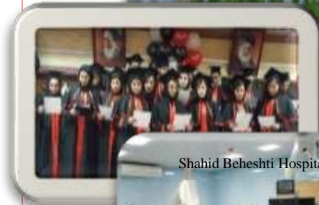
Shahid Beheshti Hospital