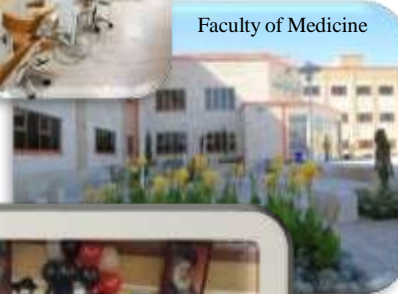
Faculty of Medicine