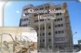
Khayerin Salamat Hospital